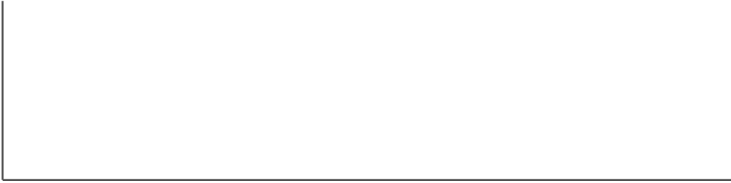
Figure 2: Women in 1994 Attained About 40 Percent of Doctoral Degrees, Up from About 10 Percent in 1961. The gain would be more dramatic if the figures since the 1980s were corrected for the large number of male foreign students receiving doctorates, but a time series for earlier years is unavailable.

* In the biological and life sciences, American women in 1994 received over 40 percent of the doctorates, up from 12 percent in 1962 ( Figure 3).