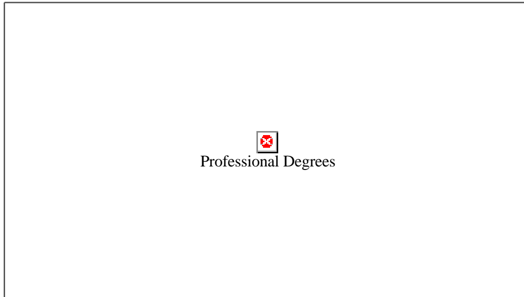
Figure 1: Women in 1994 Attained Almost Half of Professional Degrees, Up from Almost None in 1961.

* Women attained over 40% of professional degrees awarded in 1994, up from almost none in 1961 (Figure 1).